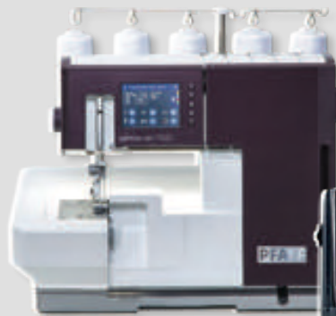
admire™ air 7000 one-touch air-threading coverlock machine